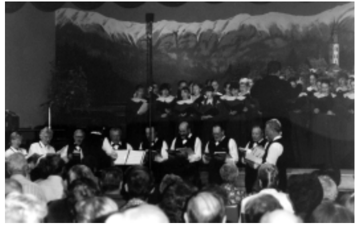
Slovenski Pevski Zbor Adelaide with Australian Youth Choir performing the Slovenian traditional song 'Marko Skace'.