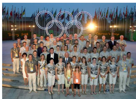
Slovenian Olympic delegation in Beijing.

The number was at the level of Sydney and Athens.