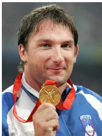
Primož Kozmus s prvim atletske olimpijskim zlatom za Slovenijo.

Peking - V finalu meta kladiva je slovenski atlet Primož Kozmus osvojil zlato medaljo, potem ko je dosegel daljavo 82.02 metra. S tem je Brežičan priboril prvo atletske olimpijsko zlato za Slovenijo. Kozmus je že v prvo vrgel prek 80.75 metra, v drugi seriji pa je dosegel 82.02 metra in bil v vodstvu vse do konca. Slovenec je za seboj pustil oba Belorusa; Vadim Devyatovski je za srebro kladivo vrgel 81,61 metra, bronasti Ivan Tihon pa 81,51 metra.