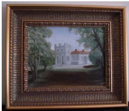
A painting of heritage listed The Tower House in Lockleys, Adelaide.