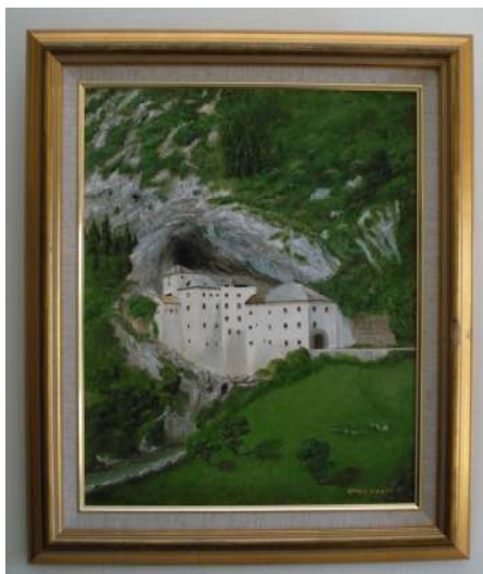
Predjamski Grad is a castle built before a cave, and is located near Postojna, Slovenia.