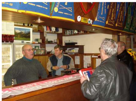
Drink at the bar.

The member's clubroom is open from 2.00pm to 10.30pm every Sunday for socialising and catching up with friends, finding new friends or seeing visitors from interstate or overseas. You can talk, play billiards, have a game of cards or play some bocce.