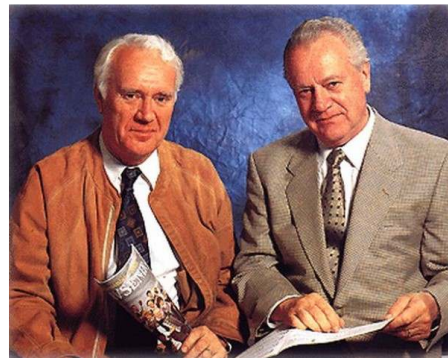
Legendarna glasbenika in izjemna avtorja - Vilko in Slavko Avsenik.

Glasba bratov Slavka in Vilka Avsenika letos beleži visok jubilej - minilo je namreč 55 let, od kar sta brata narodnozabavno glasbo približala širšemu krogu poslušalcev.