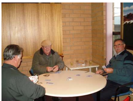
Card game in progress.