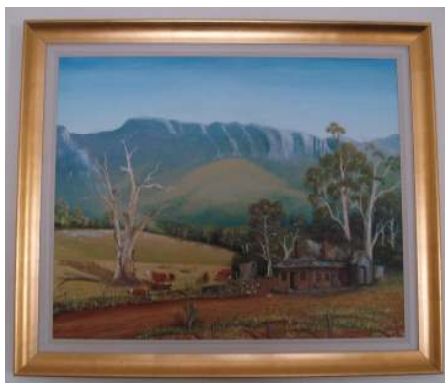
A scenic picture of the Grampians in Victoria.