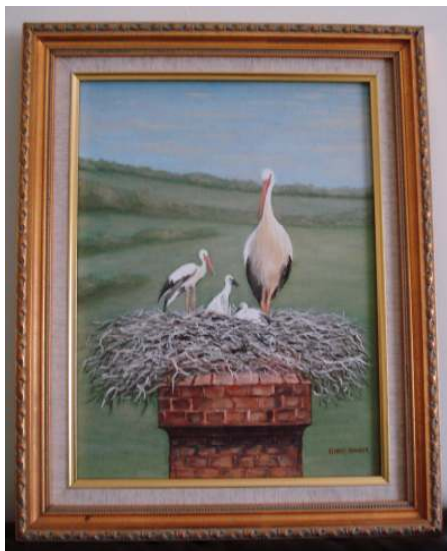
A very common scene in Prekmurje (north-east Slovenia) is Storks.