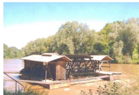
Mill on the River Mura (Mlin na Muri).

We had plenty of shopping time which is always great, so much to look at. We saw beautiful jewelry with amber and garnets, in Prague there was crystal to take your breath away, beautiful colours with gold painted on it. Far too fragile to bring home but beautiful to look at. In a market in Prague we found some lovely puppets (marionettes).