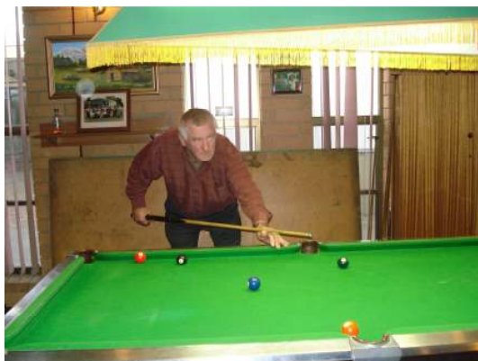
Eight ball billiards.