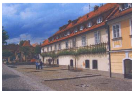
The famous 400 year old vine in Maribor.

We had plenty of shopping time which is always great, so much to look at. We saw beautiful jewelry with amber and garnets, in Prague there was crystal to take your breath away, beautiful colours with gold painted on it. Far too fragile to bring home but beautiful to look at. In a market in Prague we found some lovely puppets (marionettes).