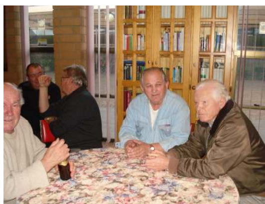
Discussion amongst friends.