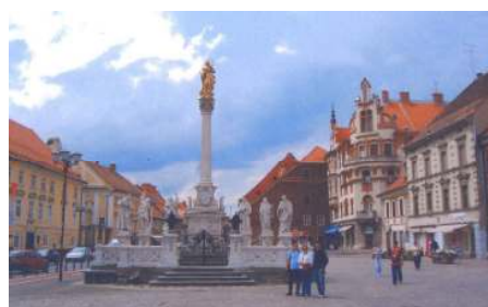
Maribor's Old Town Centre.