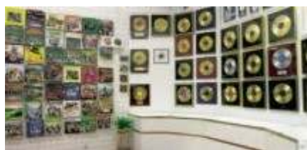
Avsenikove zlate plošče.

dan , prinaša nastop skupin Gašperji , Alpski kvintet , Gorenjski kvintet , Karavanke ter okteta Lip Bled .