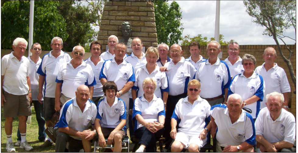
Bocce players from Triglav in front of Ivan Cankar's monument.