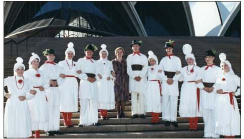
2nd generation Folkloric group in the national costume before a performance at the Opera House – mid 80's