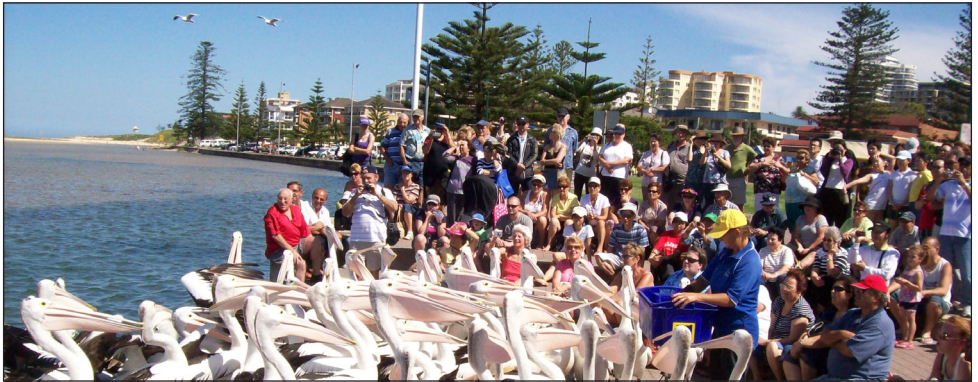
Members and friends of Triglav touring amongst pelicans

Triglav Panthers is committed to supporting the community via a range of sponsorship activities, donating over $25,000 a year in cash or in-kind to a wide range of community groups.