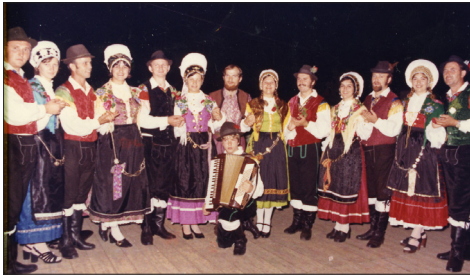
First folkloric group at Triglav