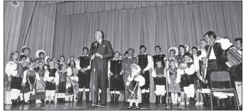
Prešeren Academy in Ashfield. Honoured guest Mr Whitlam on stage with the folkloric group, drama group and choir