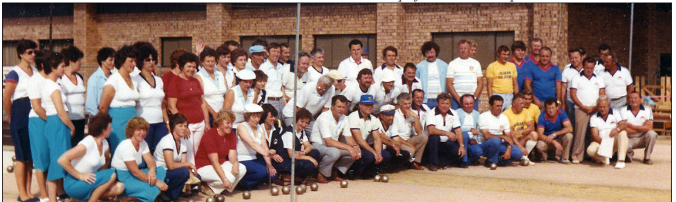
Bocce groups from Sydney, Melbourne, Geelong, Wollongong and Adelaide at the opening of the new Triglav premises on 11.12.1982.

The Slovenian club Triglav was set up in 1971 and originally registered as Triglav Pty Ltd. After the purchase of a small farm with a country style home the membership grew in size and types of different activities culminating with the building of the club premises. This happened at a time where the greater percentage of members had school age children who also participated in the numerous activities available such as the folkloric groups, various sports, cultural and amusing entertainment.