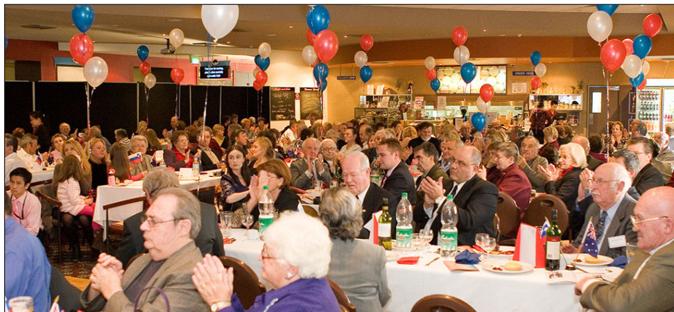
NSW Slovenian Awards and National Day at Triglav Panthers

As this youth had grown up and assimilated into the Australian way of life and the general ageing of the community continued, the pressure of economic times was strongly felt, especially as the number of active members/voluntary workers steadily decreased but the demands increased especially with the introduction of the GST, the pokies etc.